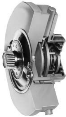
Cut-away View of "C" Rate Lift-Out Door