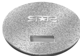
Water Resistant Dust Cover