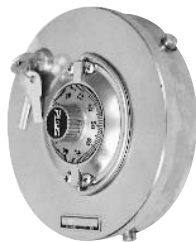
Keylock with combination. Dual Control