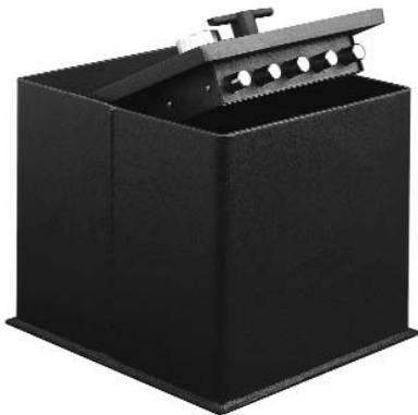
SUPER BRUTE Model B1500

You may also add many options to customize your safe, such as: a drop slot in the door, depository chute, digital keypad lock and keylocking dial to name a few. BRUTE Series safes may be installed in the floor, wall, cladding, or within a larger safe