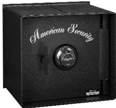
Top view of B1500 SUPER BRUTE