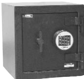
MS1414 with ESL10 lock