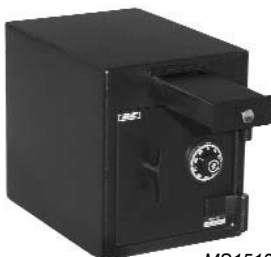
MS1513D Mini Depository Safe