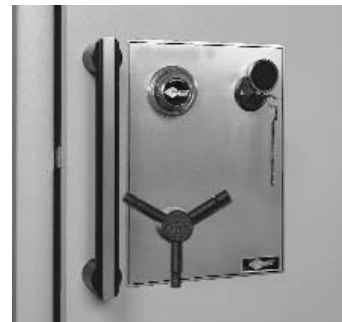
Custom AMVAULT escutcheon plate, shown with optional auxiliary key lock and pull handle, with matching operating handle.

*Tri-spoke handle standard on all models.