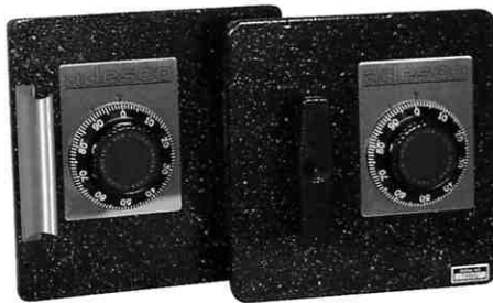
SO Door & S Door