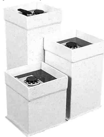
SO 807, SO 812 & S 817