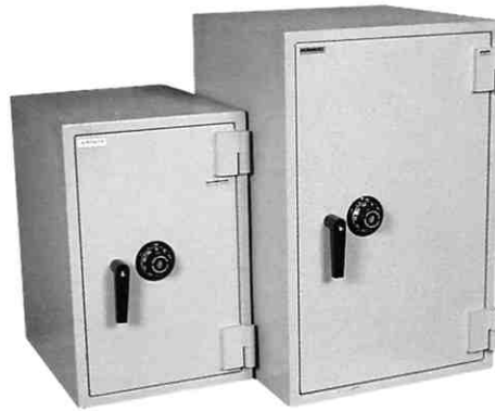
CMP 4290 & CMP 8640